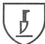
Protection against impact cut